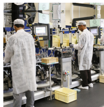
Renault

Contracting authorities: Métropole Rouen Normandie