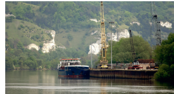
Ango Port

South of Rouen, 1 hour from Paris, Le Havre and Caen, Le Moulin IV Park has direct access to the A13 Paris-Caen motorway. It is also located close to the stations of Saint-Aubin-lès-Elbeuf and Oissel, and the Port Angot river platform.